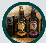
Craft & Artisan Food & Drink