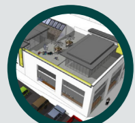
Community Building & Housing